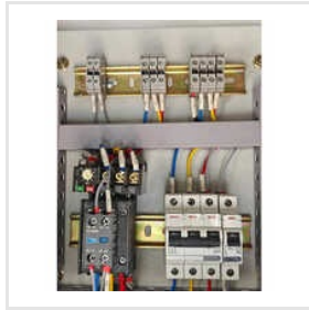
Dol Starter 2 Hp