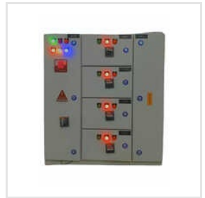
Three Phase ABB Control Panel