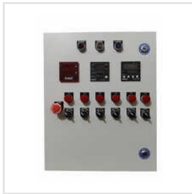
Three Phase Heat Control Panel