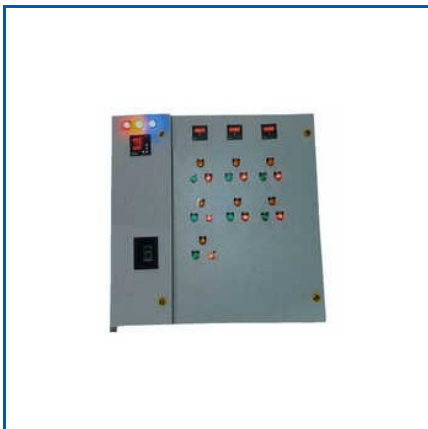
THREE PHASE STP CONTROL PANEL

10kW Three Phase APFC Panel, 150kW Three Phase MCC Control Panel, 300kW Three Phase MCC Control Panel, 50kW Three Phase APFC Panel, Banquet Hall Multi Source Panel, Dol Starter 2 Hp, Main Electrical Panel, Three Phase ABB Control Panel, Three Phase ATS Control Panel, Three Phase Distribution Control Panel, Three Phase Heat Control Panel, Three Phase Motor Control Panel, Three Phase PCC Control Panel, Three Phase PLC Control Panel, Three Phase STP Control Panel, etc.