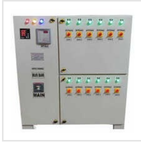
10kW Three Phase APFC Panel