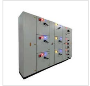
Banquet Hall Multi Source Panel