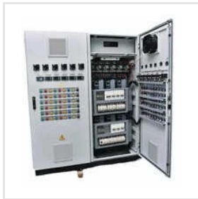
Three Phase PLC Control Panel