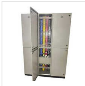
300kW Three Phase MCC Control Panel