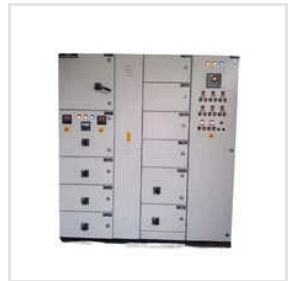
Main Electrical Panel