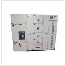
Three Phase PCC Control Panel