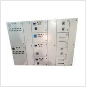
50kW Three Phase APFC Panel