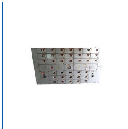
THREE PHASE MOTOR CONTROL PANEL