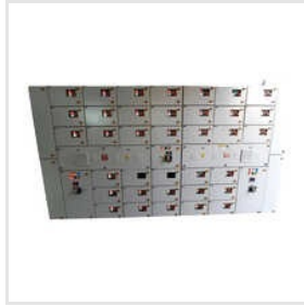
Three Phase Motor Control Panel