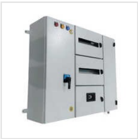
Three Phase Distribution Control