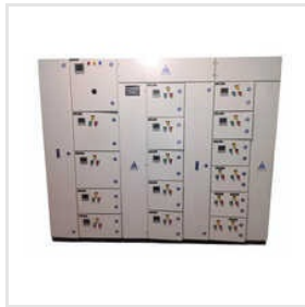
150kW Three Phase MCC Control Panel