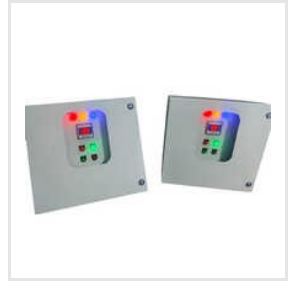
Three Phase Star Delta Starter Control Panel