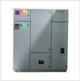
Three Phase ATS Control Panel