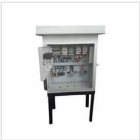
Three Phase Street Light Control Panel